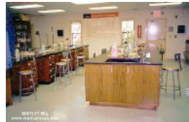
Actual photo of the laboratory